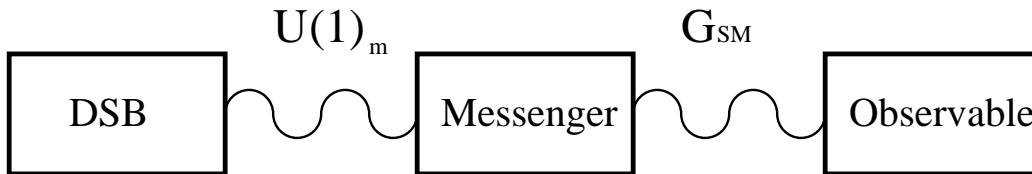
Figure 5.1: Schematic structure of DNNS model